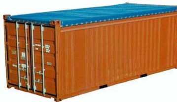
20' / 40' Open Top Container