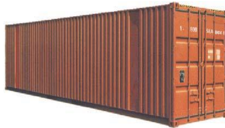
40' High Cube Container