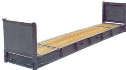
20' / 40' Flat Rack Container