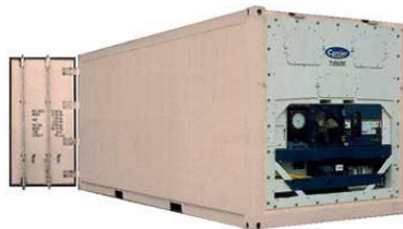
20' / 40' Reefer Container