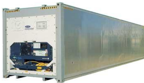
40' High Cube Reefer Container