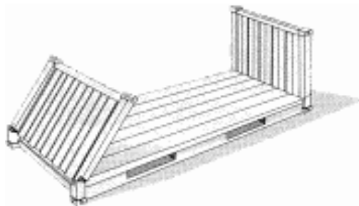
20' / 40' Collapsible Flat Rack Container