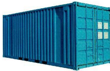
20' / 40' Conventional End Open Container

The following is a brief description of the various ocean freight containers.